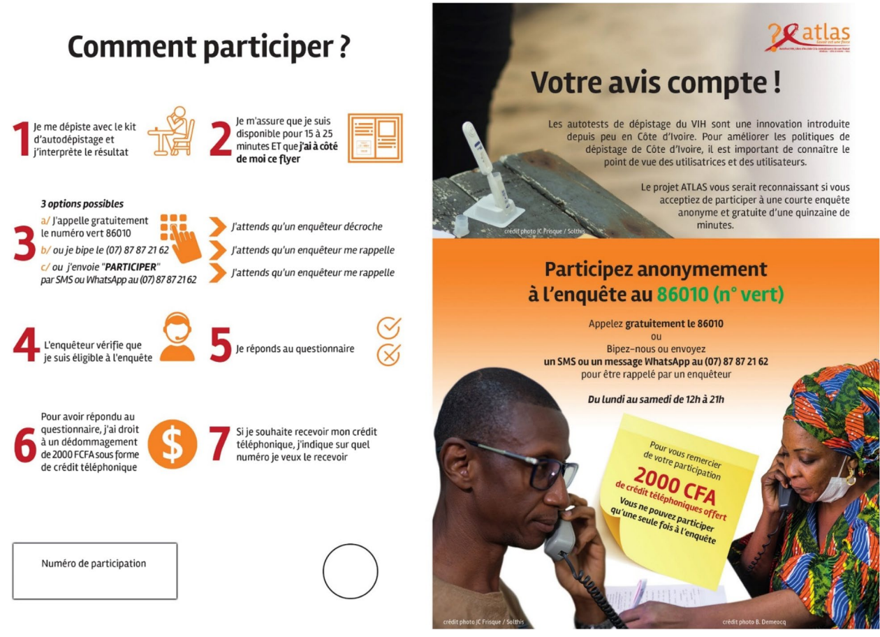
Fig. 3 Recto of the leaflet distributed with HIVST kits to invite users to participate in the survey (Ivorian version)

therefore be considered anonymous according to the European General Data Protection Regulation. All procedures were described in a publicly available data management plan (https://dmp.opidor.fr/plans/3354/export.pdf).